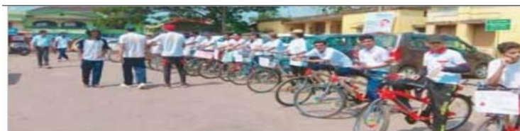
എം.ഇ.എസ്. കല്ലടി കോളേജിലെ നേവൽ എൻ.സി.സി. കേഡറ്റുകളുടെ നേതൃത്വത്തിൽ നടന്ന സൈക്കിൾ റാലി