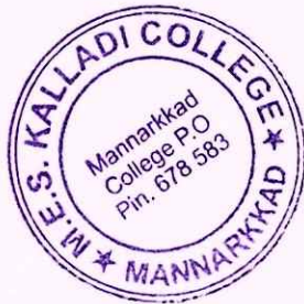
Principal M.E.S. Kalladi College Mannarkkad